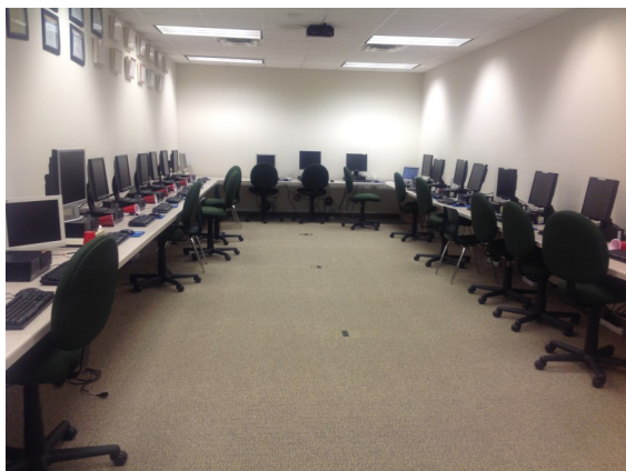
Our updated and expanded computer lab.

Finally, I would like to invite all of you to join us for the school's opening service on Monday, August 28th, at 6:30 p.m. This is the official start to the school year. Classes will begin on Tuesday, August 29th, at 8:45 a.m. We will begin the school year with 109 students from 3K through 8th grade. The Lord has truly blessed us as we look forward to a new school year.