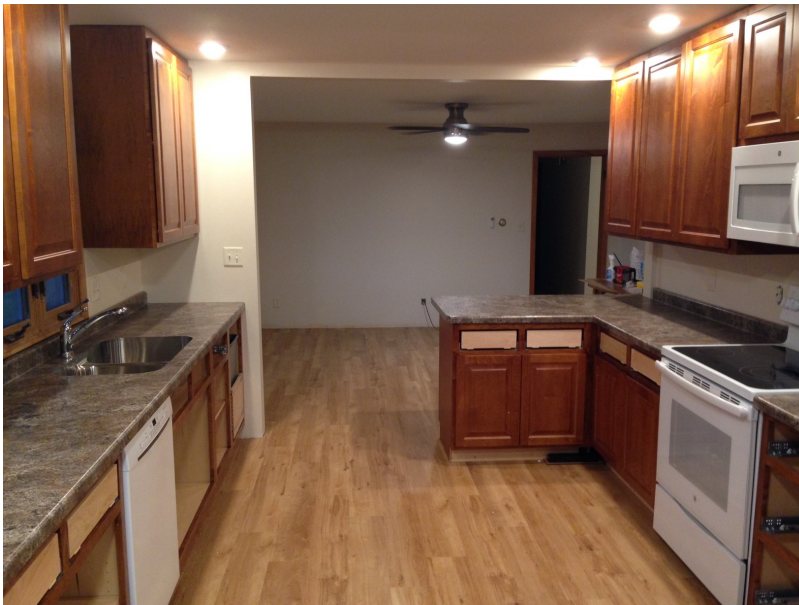
The remodeled kitchen and family room.

After the project is complete and before the new pastor moves in, we will have an open house event some Sunday after the church service.