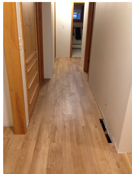
New flooring in the hallway.