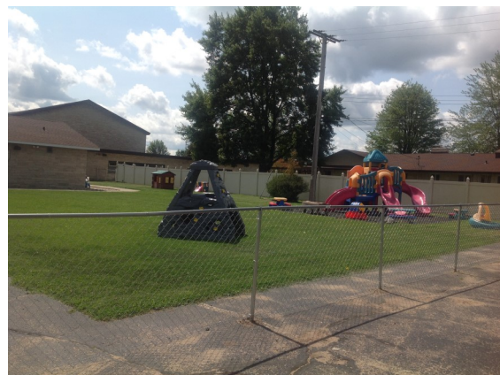
The fencing around the larger playground area was placed on the pavement to allow for easier lawn mowing and a safe space for the children to use riding toys.